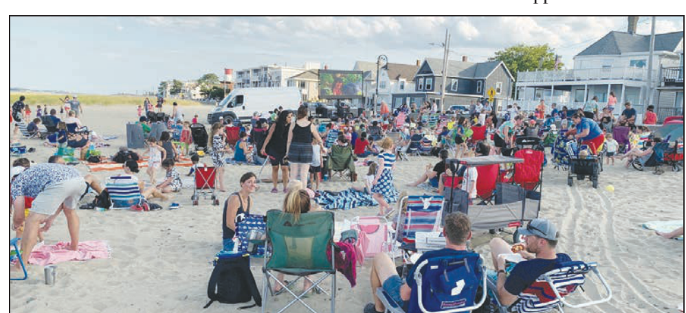
Hundreds of children and families flocked to the beach for a free movie night in Winthrop.