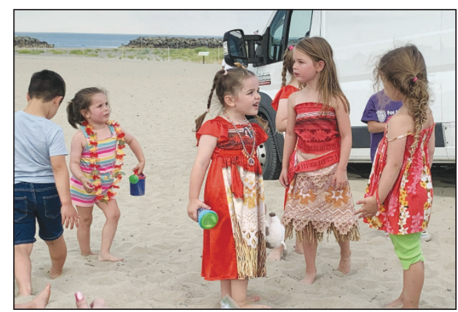
Children dressed up for a showing of Moana on the beach in Winthrop last summer.

Grant applicants can come from any community as long as their idea centers one of our region’s public beaches. Better Beaches funds will be awarded to organizations, programs, individuals, and creatives who empower, amplify and invest in community members of color, people with disabilities, people who’s first language is not English and members of the Queer community. The event must be free and open to the public, be ex-