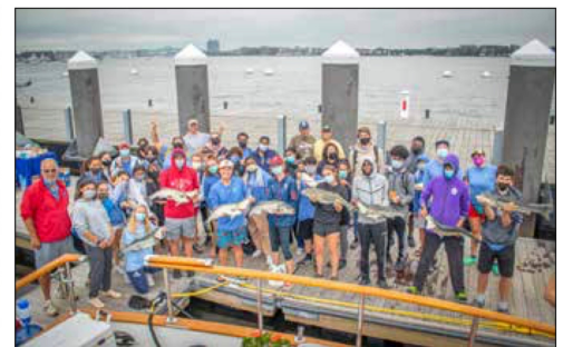
9 local teens were big winners at this year’s Save the Harbor/Save the Bay Youth Fishing Tournament at Fan Pier Marina on August 10, including four from South Boston