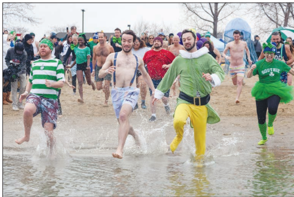
Participants of the 2022 Shamrock Splash run into the cold water of East Boston's Constitution Beach

Last year, money raised at the splashed sponsored events in Winthrop including movie nights, kayak-