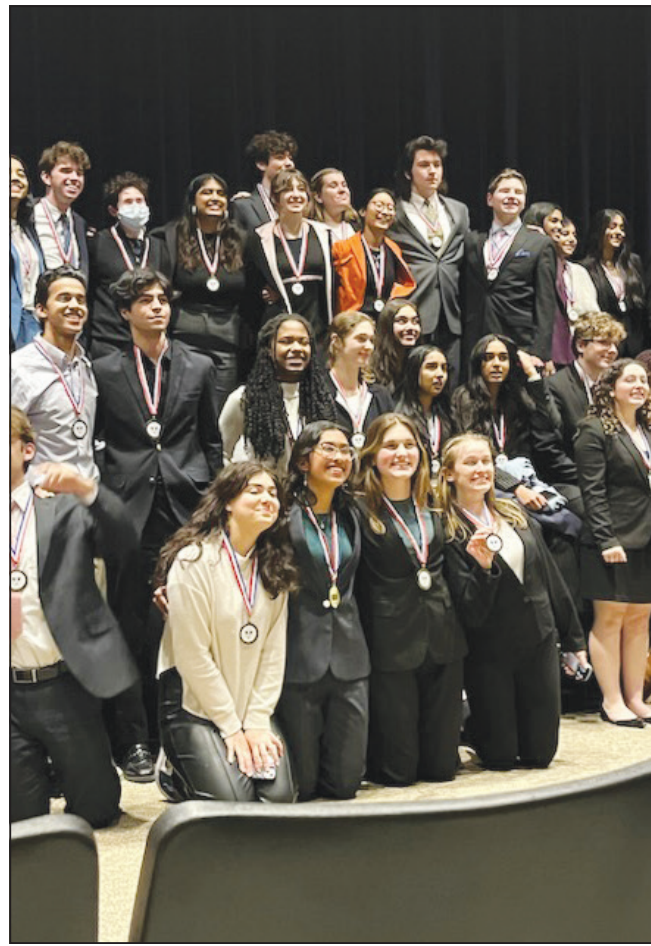
Members of the Revere High School Model UN team shown at the BOSMUN XXII this past weekend.