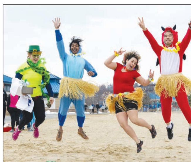
Splashers dress up in all kinds of costumes for the event, and the best costume wins roundtrip JetBlue tickets.

Save the Harbor's success would not be possible without our program partners and event sponsors, including Arctic Chill, FMC Ice Sports, Bay State Cruise Company, Blue Cross Blue Shield of MA, The Blue Sky Collaborative, Boston & Maine Webcams, The Boston Foundation, BostonHarbor.com, Boston Properties, Coast Cannabis, The Coca-Cola Foundation, Comcast, Cronin Group, Constellation Generation, Comcast Foundation, the Daily Catch, Department of Conservation and Recreation, Eastern Salt Company, Inc, Executive Office of Energy and Environmental Affairs, Harpoon, IR+M Charitable Fund, JetBlue, John Hancock Financial Services, Massachusetts Convention Center Authority, Massport, P&G Gillette, Mix 104.1, National Grid, and The Richard Saltonstall Charitable Foundation.