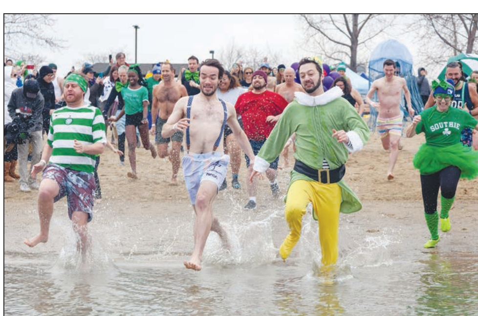
Splashers dress up in all kinds of costumes for the event, and the best costume wins roundtrip JetBlue tickets.