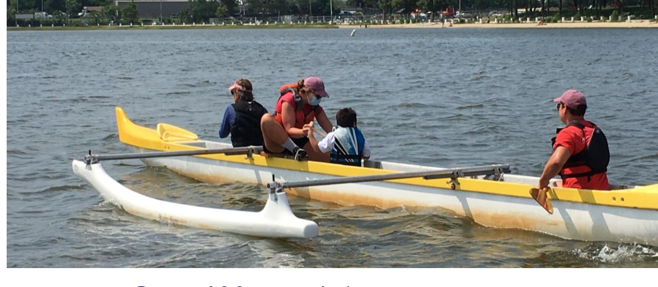
Over 100 special events at our Metro Boston beaches